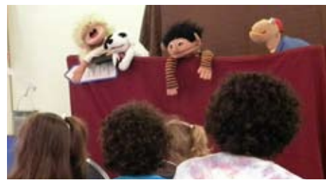
Summer Vacation Bible School