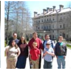
Spring Mystery Trip Newport, RI Mansions