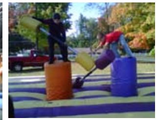
Youth Fest Jousting Competition