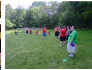
Teen Camp Ultimate Frisbee