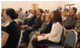
Grand Opening Service!