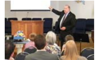
Missionary teaching on Missions