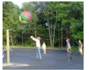
Big Ball Volleyball Teen Activity