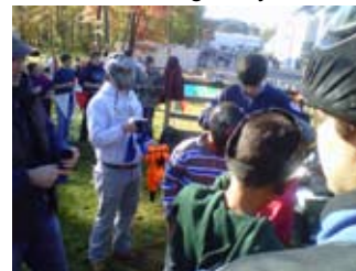
Youth Fest Paintball