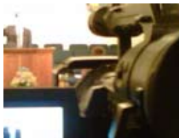
All services live-streamed online!