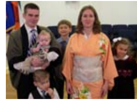
Church Kids with missionaries to Japan