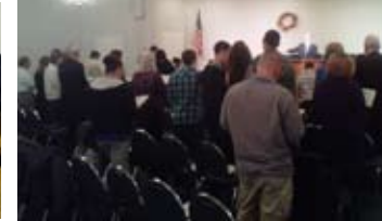
Missions Conference 2013