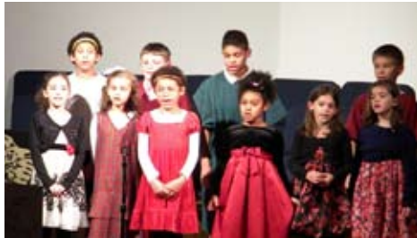
Children's Christmas Program