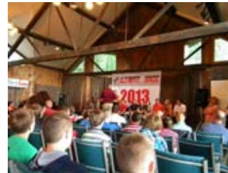
Teen Camp Preaching Rally