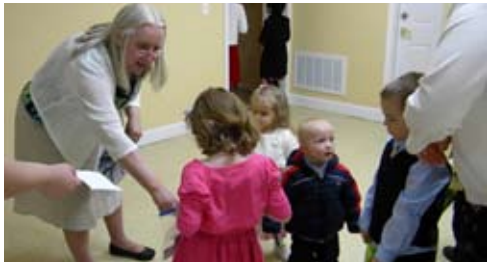
Easter Trail Hunt & Palm Sunday Program