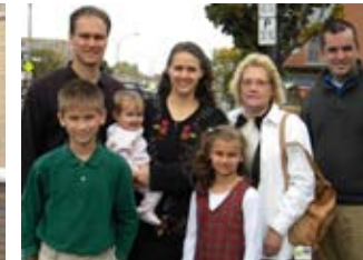
Foreign Missions Trip to Montreal, Quebec