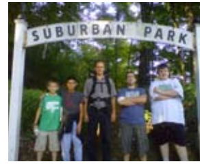
Teen Fall Hike Teen Activity