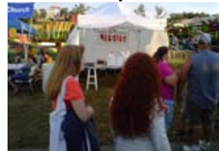
Terryville Fair Outreach