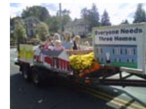
Bristol Mum Festival Outreach