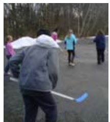
Winter Games Teen Activity