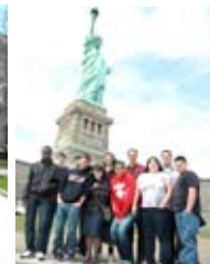
Mystery Trip Statue of Liberty