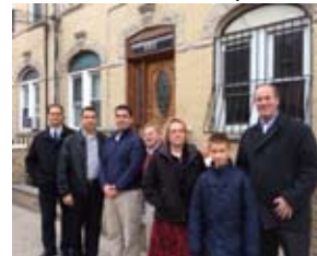
Missions Trip to Brooklyn, NY