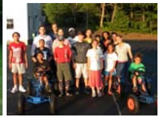
Crazy Car Teen Activity